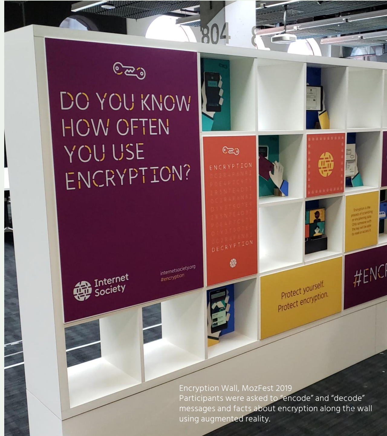
Encryption Wall, MozFest 2019 Participants were asked to "encode" and "decode" messages and facts about encryption along the wall using augmented reality.