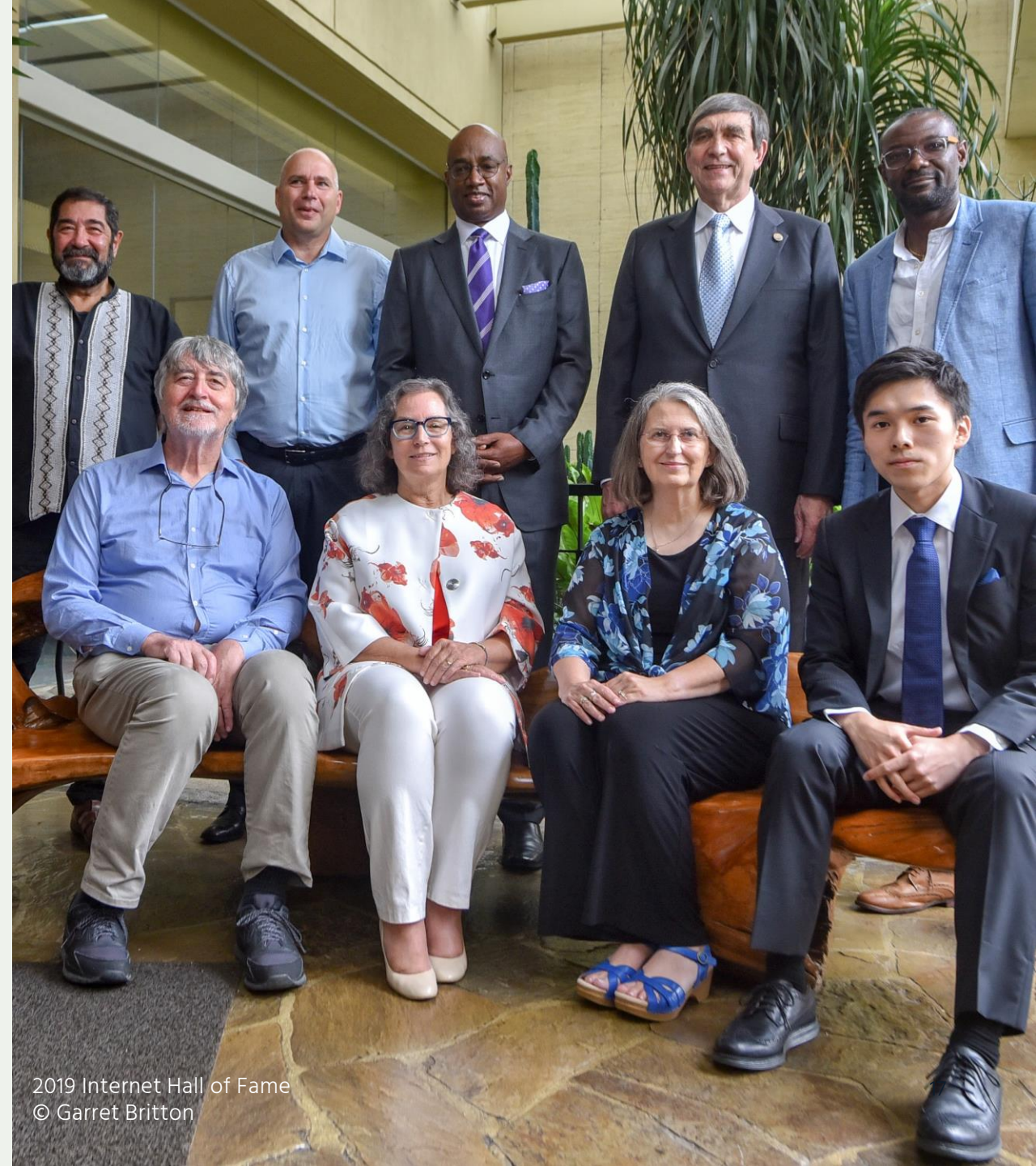
2019 Internet Hall of Fame